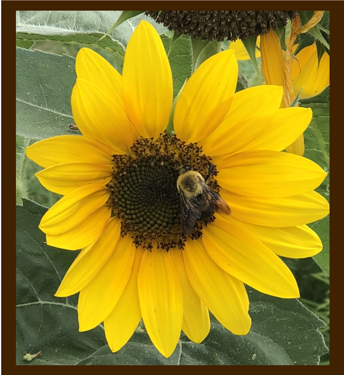
A visitor to our Wildlife Habitat Pollinator Garden

A monthly newsletter published for the parish and friends of Christ Episcopal Church of Bowling Green, Kentucky