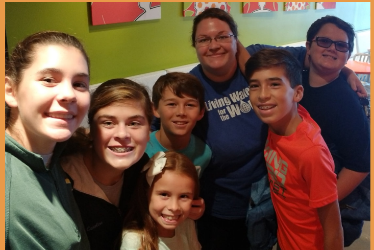
The EYC enjoying some post-volunteering Fro-Yo after a hard afternoon of helping the Warren County Backpack Food Program