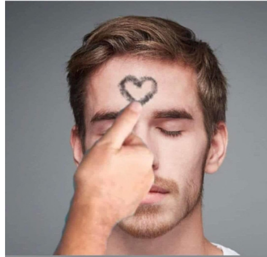
When Valentine's Day falls on Ash Wednesday